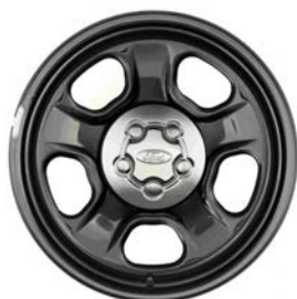
18" 5-spoke painted black steel wheels with center caps (5 th wheel is full-size spare) – Standard