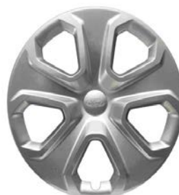
18" 5-spoke full face wheel covers with metal clips – Optional (65L)