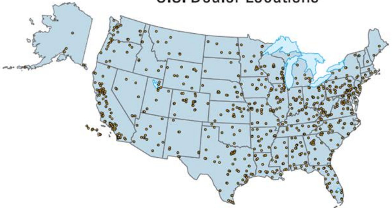
Image: US Dealer Locations