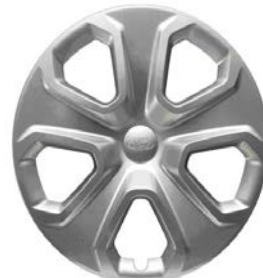
18" 5-spoke full face wheel covers with metal clips – Optional (65L)