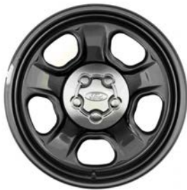
18" 5-spoke painted black steel wheels with center caps (5 th wheel is full-size spare) – Standard