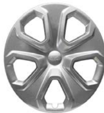
18" 5-spoke full face wheel covers with metal clips Optional (65L)