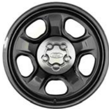
18" 5-spoke painted black steel wheels with center caps (5 th wheel is full-size spare) – Standard